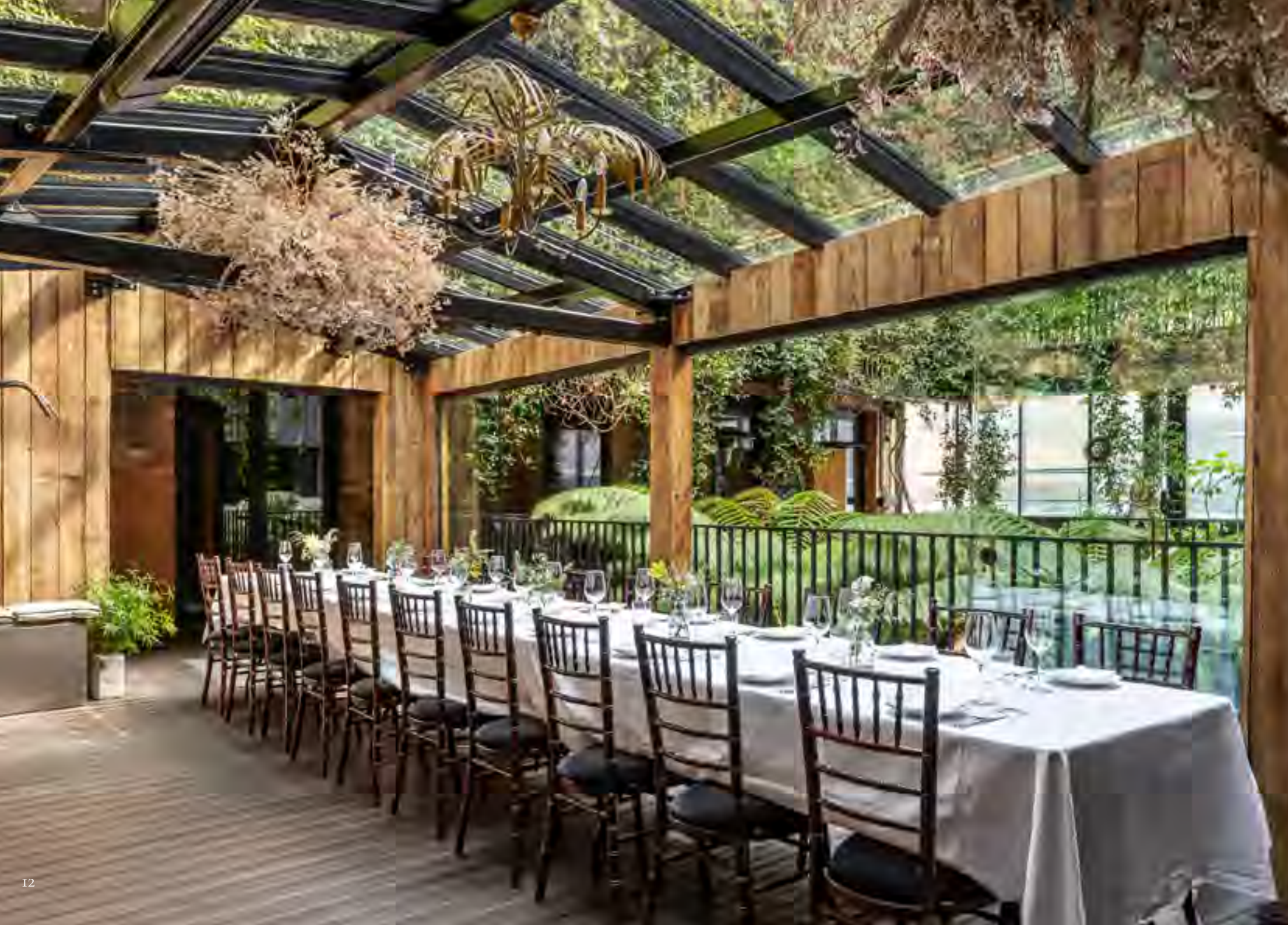
Photo of Jurema North: Available All Year Round, Monday to Thursday.