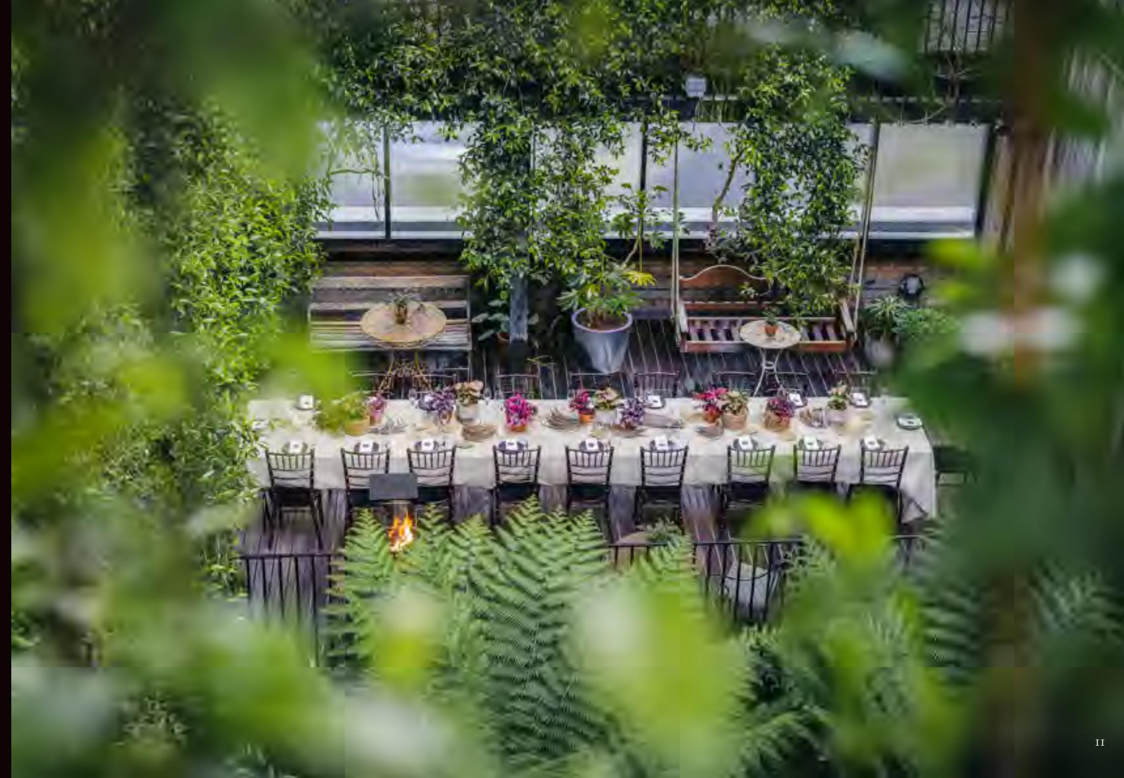
Photo of Jurema South: Available May-September, Monday to Thursday.